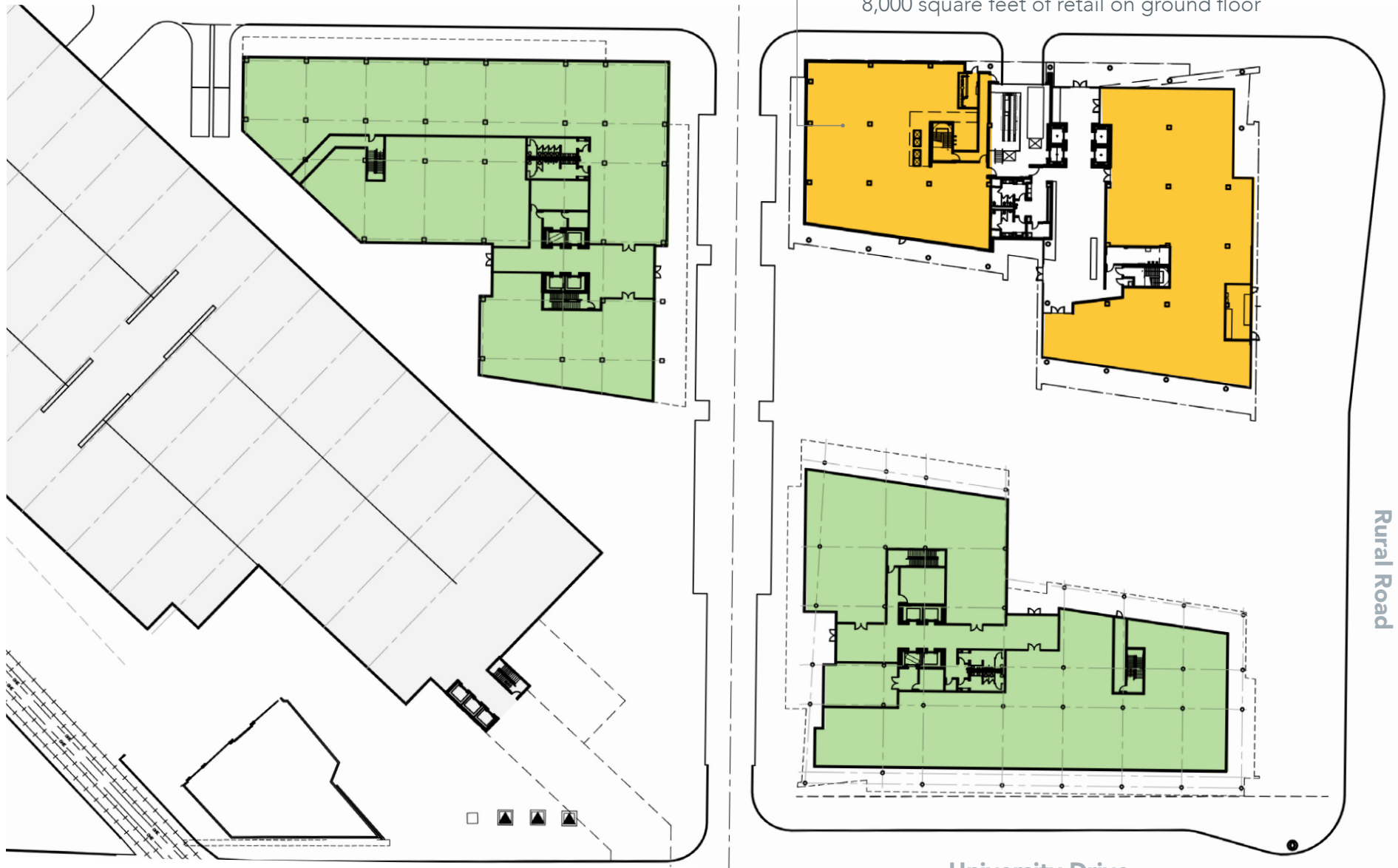
Conceptual site plan

8,000 square feet of retail on ground floor